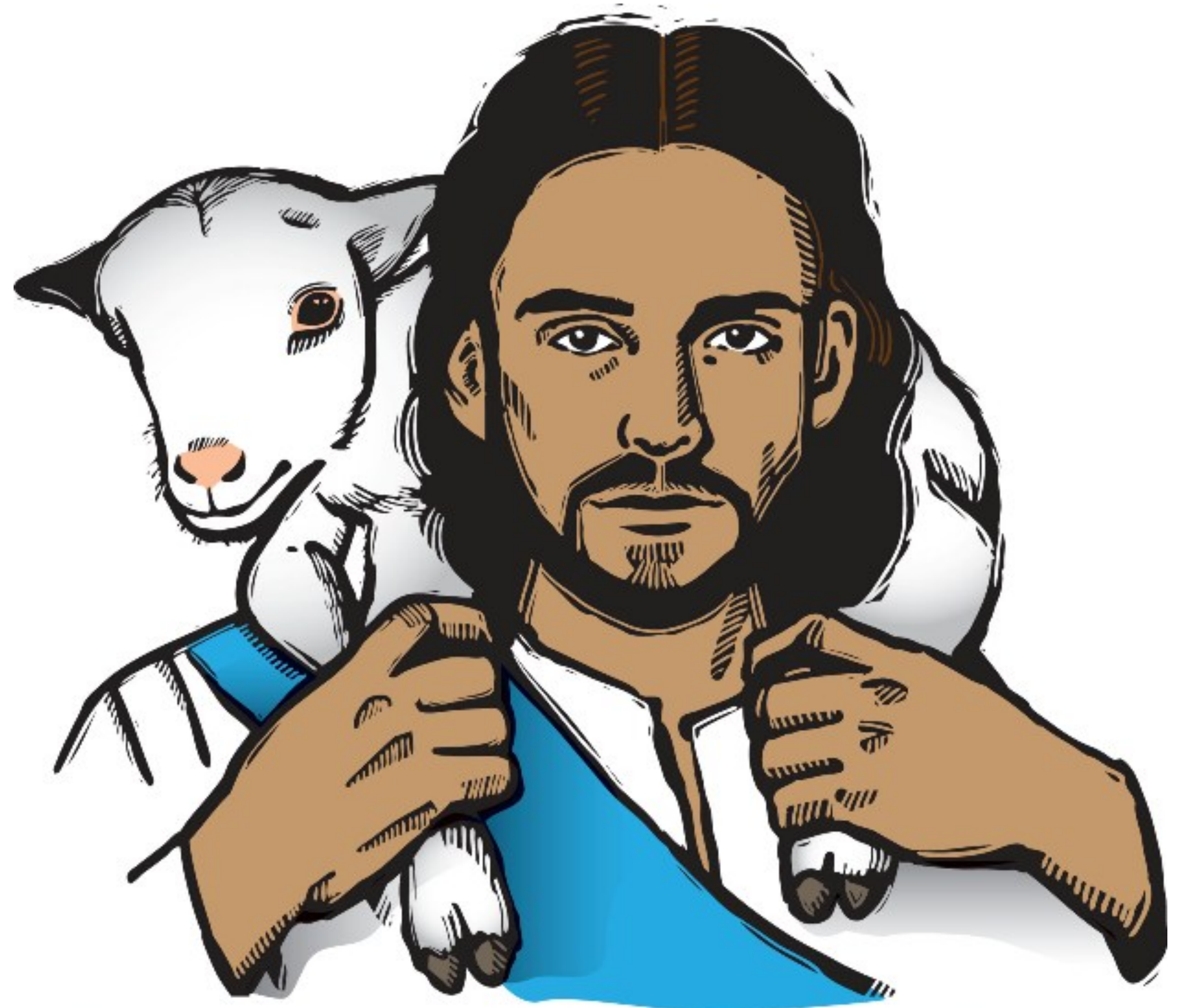
The Parable of the Lost Sheep